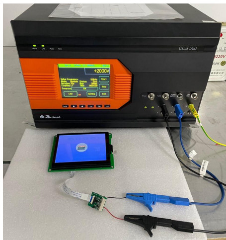
3.2 群脉冲测试图 EFT test