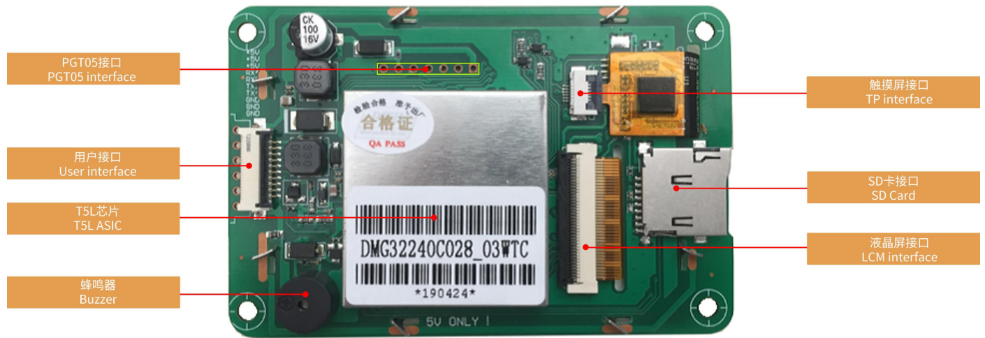
硬件接口图 Hardware interface