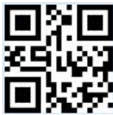
Read Version Information