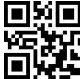
CODEBAR Max Length

a) Scan "CODEBAR Max Length" setting code