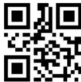
CODEBAR Min Length

a) Scan “CODEBAR Min Length” setting code