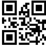
ITF25 Min Length