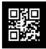
Only Read Forward(Reversed code)