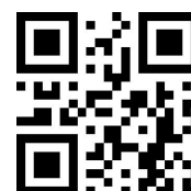
*Decoding successfully prompt light-Green