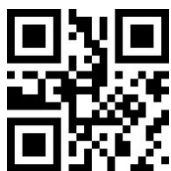
Cancel the previous read a string of data