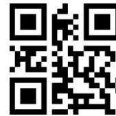
*Code93 min length at 4

Scan following code to change max length of code93