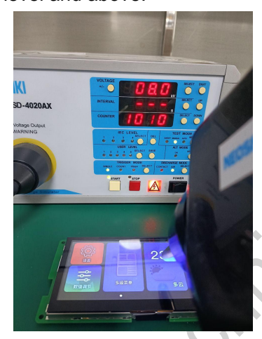
3.1 Electrostatic discharge test

Test process: the product was placed on the test bench to perform contact and air discharge in turn of the serial screen iron frame and display area as shown in Fig.3.1 below. During the experimental process, it was observed whether the screen is dead, black, white, splash, or reboot. According to the experiment results, the performance is in line with the criteria GB/T 17626.2 B level and above.