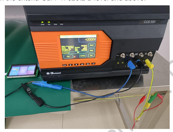
3.2 EFT test

Test process: the product was placed on the test bench to perform contact and the smart screen is energized by the power supply coupled with a EFT generator as shown in Fig. 3.2 below. During the experimental process, it was observed whether abnormal reset, display or touch phenomena occurs. According to the experiment results, the performance is in line with the criteria GB/T 17626.2 B level and above.